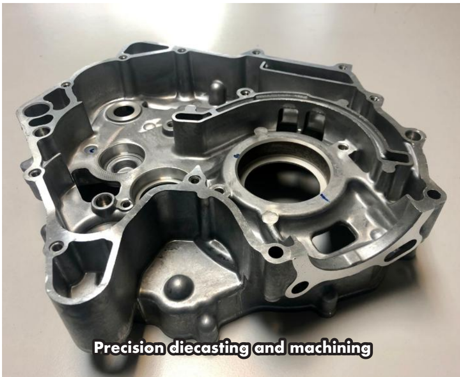
Precision diecasting and machining